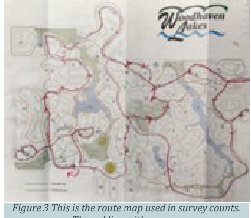
The red line with arrows.

As you see by the numbers above, there has been an increase on each successive count conducted thus far. Survey counts will inevitably be influenced by factors such as weather, time of day, and location of deer relative to the route. Considering the deer present but not seen during the surveys is the 15% correction factor used (which was used by the USDA-WS in the first survey). For consistency, we are continuing to use this factor. This is a standard correction in wildlife surveys. Counts will continue to be taken periodically to assess the population which will provide a better estimate of the population and trends over time.