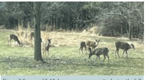
Figure 2 Groups of 5-10 deer are a common site during the fall, winter, and spring seasons on Woodhaven property.

Two population surveys were conducted in January and February 2023 by staff traversing the original route (Figure 3) that was set up by the United States Department of Agriculture-Wildlife Services (USDA-WS) in April 2022. The following are the summarized results of all the counts that have been conducted to date.