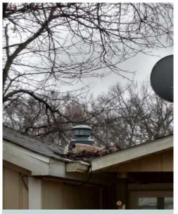
on top of this roof? This shows how difficult it is to locate nests out on property.

With the return of spring, we see a return of geese to the campground. The goose population has increased over the past few years with numbers estimated at 100-150. As you read this article, nest and egg control activities will be in Figure 4 Can you see the goose nesting progress. Geese begin nesting in the latter part of March in this area. A few nests have already been identified with additional pairs of geese